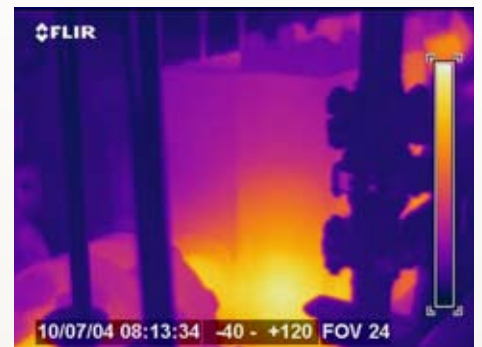
P3408B Glycol Pp B