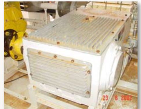
Glycol Pp Gearbox & Pump

"We are currently integrating the condition monitoring strategies of the two legacy companies," Bob Speirs explains. "It's a steady process but we're now asking our teams to extend the scope of their infrared inspections. They are taking in a lot more mechanical applications into the process and in particular power transmission systems."