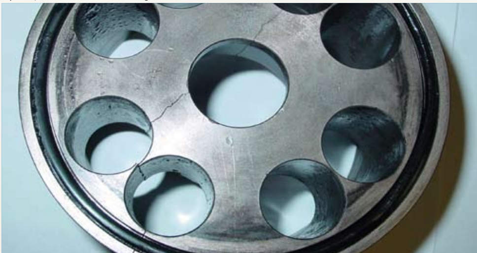
Glycol Pp Suction Vv Guide Damage

For more information, visit www.flir.com or contact: