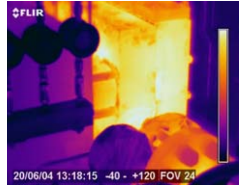
P3408A Glycol Pp A