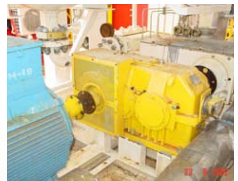
P3408A Glycol Pp A Discharge Valves